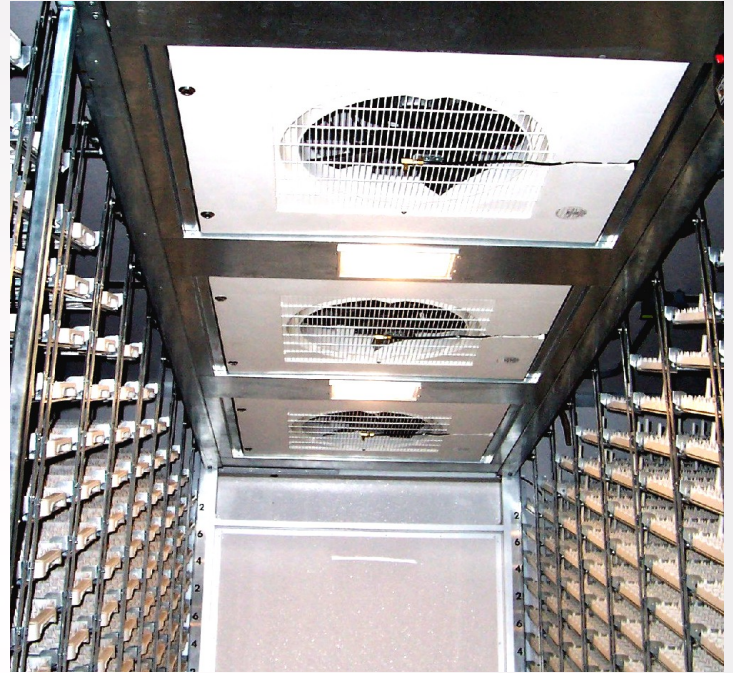
High intensity lighting system mounted between the fan boards