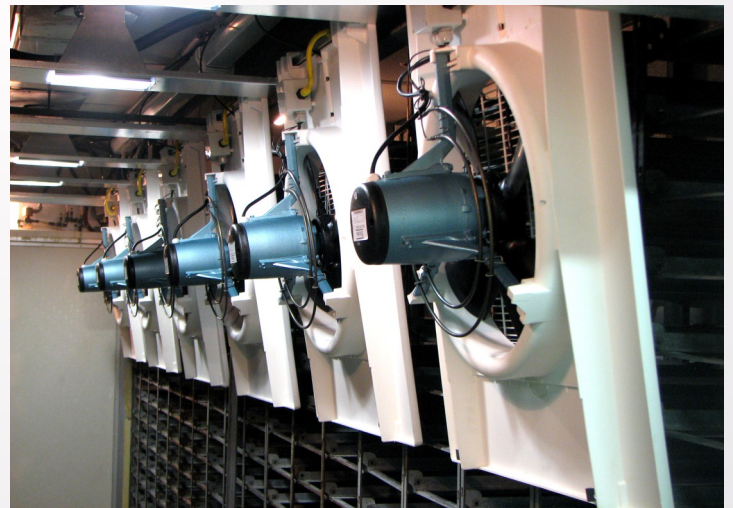
Heating element and humidity system mounted to plastic fan board