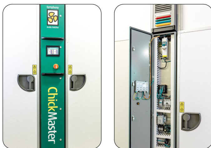
ROCK Control easily accessed via the center panel