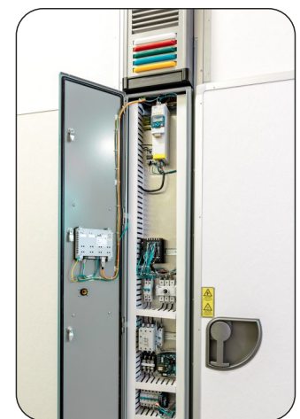
ROCK Control easily accessed via the center panel