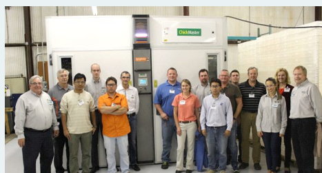
Medina training session