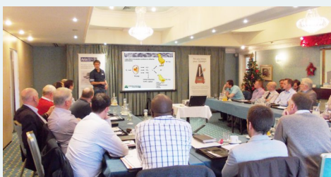
Bridgewater training session

Training sessions were held at the ChickMaster Medina factory in September and at the ChickMaster UK Bridgewater factory in December. Over 40 representatives from more than 20 customers attended the two sessions. The training sessions included updates on product features and benefits, factory tours and guest speakers presenting on the latest hatchery practices. ChickMaster Academy will be providing new training sessions in 2016.