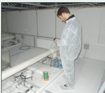
Probes connected to the Resonance device are routed through the incubator roof