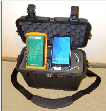
Resonance device with hard-shell case *Android phone or tablet not included

Twenty-five foot probes connected to the wireless device are routed through the incubator roof to transmit actual zone temperature readings wirelessly via Bluetooth technology to an Android device* using a unique ChickMaster Android app.