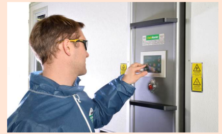
Latest Gen IV controls