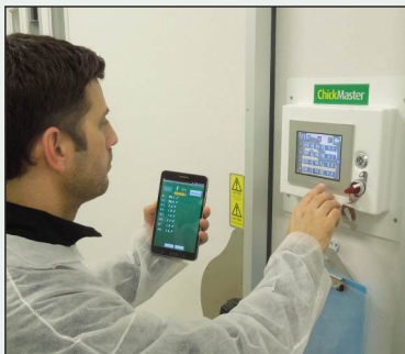
An Android device receives the actual temperature values and allows the technician to make adjustments at the control screen