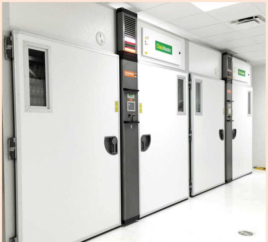
Avida Symphony Setters at work producing high quality poualts!

Contact the local ChickMaster Sales Manager or sales representative to see how ChickMaster Avida setters and hatchers can put your Hatchery in Harmony .