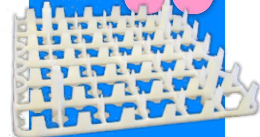
The NEW Chick Master JW 42 Egg Tray