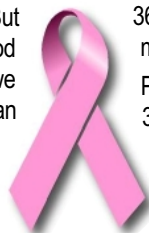
10 cents will be donated to breast cancer charities for every tray sold