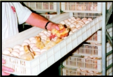
Turkey Hatcher Trolley: Specially designed to allow poult to develop properly after hatching.