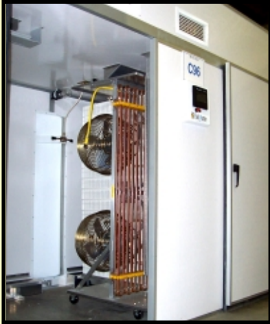
Hatchers available in both sliding and swinging door design.