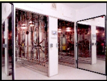
Stainless Steel interior walls: All interior walls and many interior fixings are made from stainless steel.