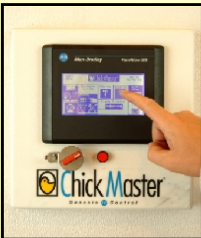
Genesis IV Control: Touch screen simplicity and complete system control at your fingertips.