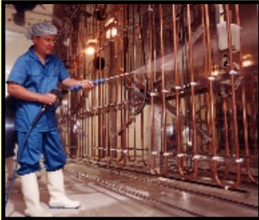
Bio-security: All systems designed for simple and complete cleaning.

Turkey Hatchers employ a specially designed Hatcher Trolley system that allows the poult to develop properly in the critical period after hatching and before transfer.