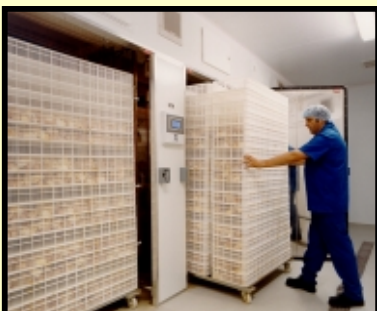
High quality Hatcher baskets: strong stacking plastic hatcher baskets designed for the rigours of hatchery use.