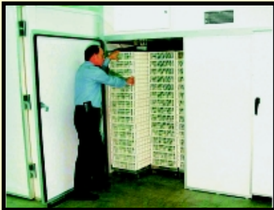
Classic VF66-120: hatches up to 11,592 poult